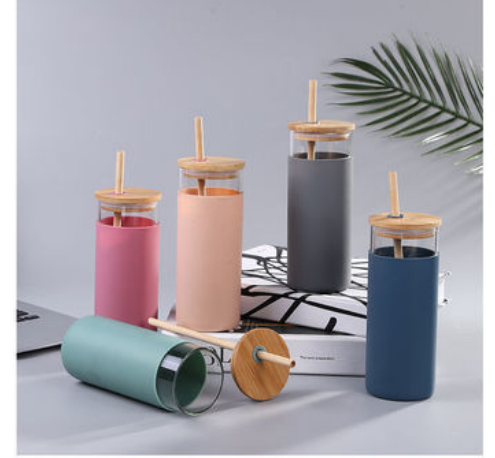
Product name: Bamboo lid cup Product material: Borosilicate Product color: Elegant pink, noble blue, light blue, vibrant orange, simple gray

Product parameters are shown for you Sophistication is reflected in the details