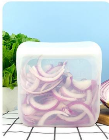
Vegetarian dishes are not easy to spoil