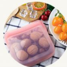
nut Preservation is not easy to break

Can be slowly cooked in low temperature and water