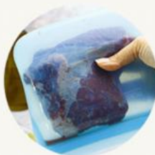
Frozen meat Thaw directly in the microwave