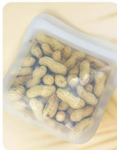
Nuts are not susceptible to moisture