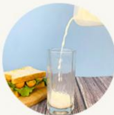
breakfast Heat the milk

Open the seal when the microwave is heated