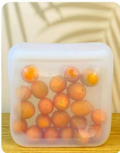
Fruits are not perishable